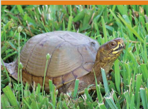
three-toed box turtle

Check out the adoptees listed inside, then fill out the attached form and mail to the Wildcat Glades Conservation & Audubon Center.