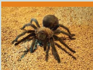
Texas brown tarantula