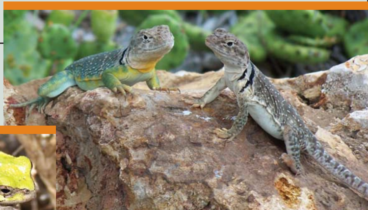
male eastern collared lizard